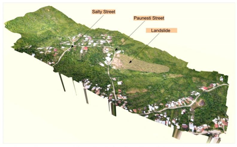
3D image of the northern part of Gornet village, Prahova County (Romania), based on the aerial photographs collected with the UAV.

GEO-CRADLE Pre Kick-Off Meeting, 18.02.2016, Athens